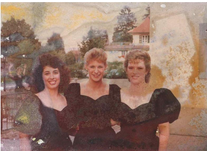
A photo of 3 friends from the 1993 time capsule.