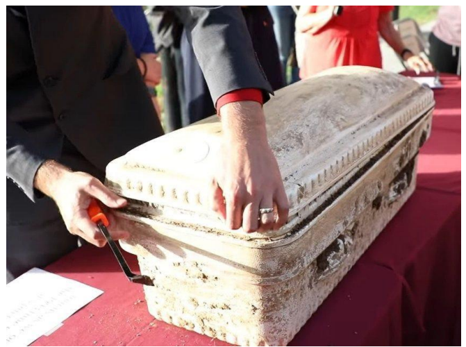
Opening the 1993 time capsule.