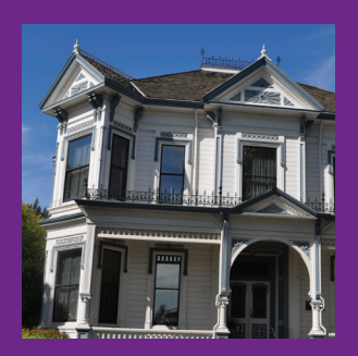
The Hayward Area Historical Society joins with people of all ages in the preservation, study and interpretation of the diverse heritage of our community. Through educational programs, interpretive exhibitions and the preservation of historic sites and artifacts, the Historical Society promotes an understanding about our shared history as we face the issues that will shape our future.