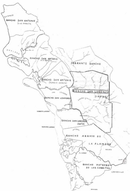
Spanish and Mexican land grants in Alameda County

My home looked like the houses of the other Californios . They were built of adobe and had red tile roofs. They were very comfortable. They kept cool in summer and warm in winter. The furniture in our house came by sailing ship to the San Francisco Bay from places as far away as Boston, China, Persia, and Switzerland.