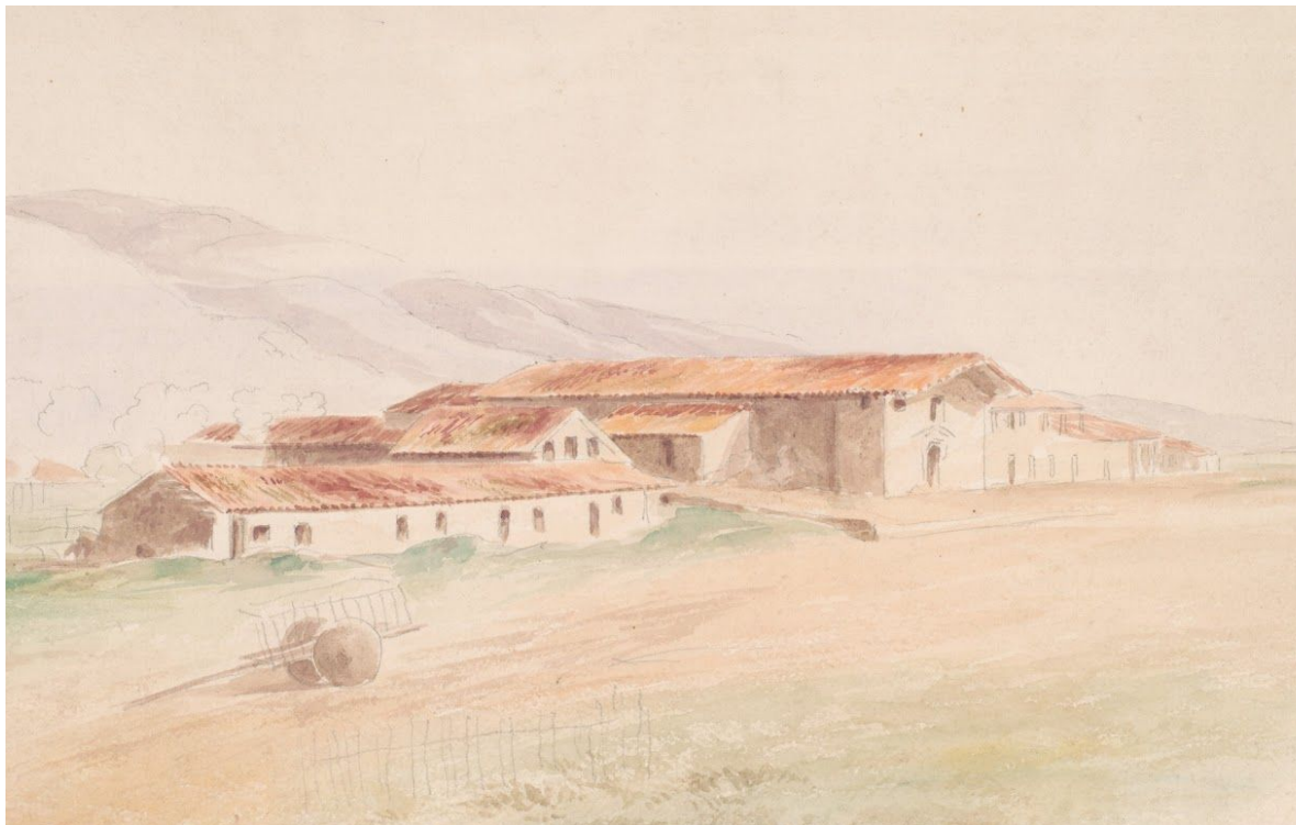
Mission San Jose, established in 1797. The mission was surrounded by lands for grazing cattle, and relied on fresh water from San Lorenzo Creek.

During the second half of the 18th century, from 1769-1833, Spanish explorers and missionaries moved into California, conquering lands for the Spanish king and establishing missions for the Catholic Church. The closest mission to what is now San Lorenzo was south of the area, Mission San Jose. The missions were an institution used to control the native population by converting them to the Catholic religion, while also making them less able to resist losing their land as European settlers moved in.