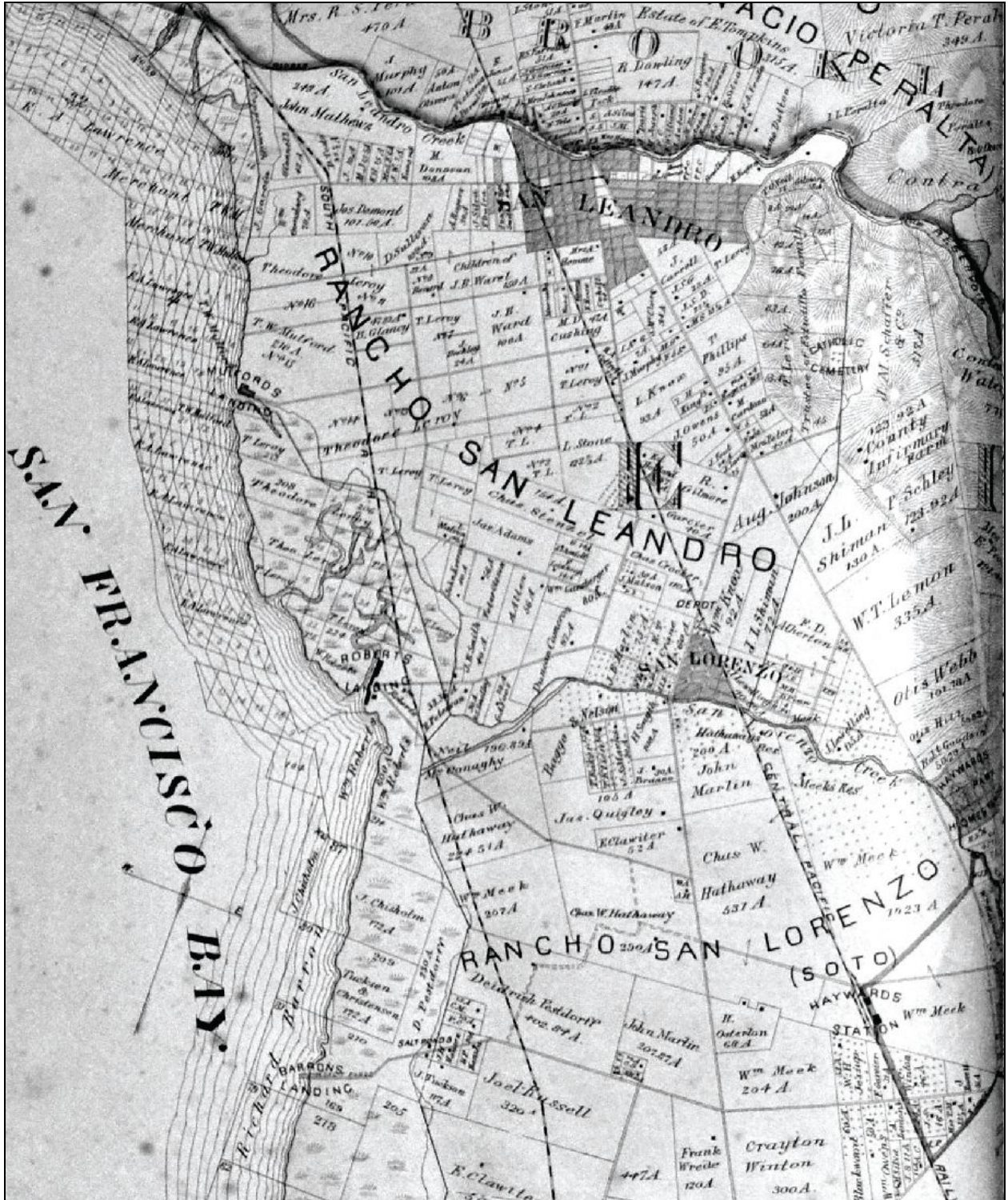
1878 area map, showing boundaries for Rancho San Leandro & Rancho San Lorenzo

In 1848, after a two-year conflict between the U.S. and Mexico over territory, the Treaty of Guadalupe Hidalgo was signed. The treaty called for