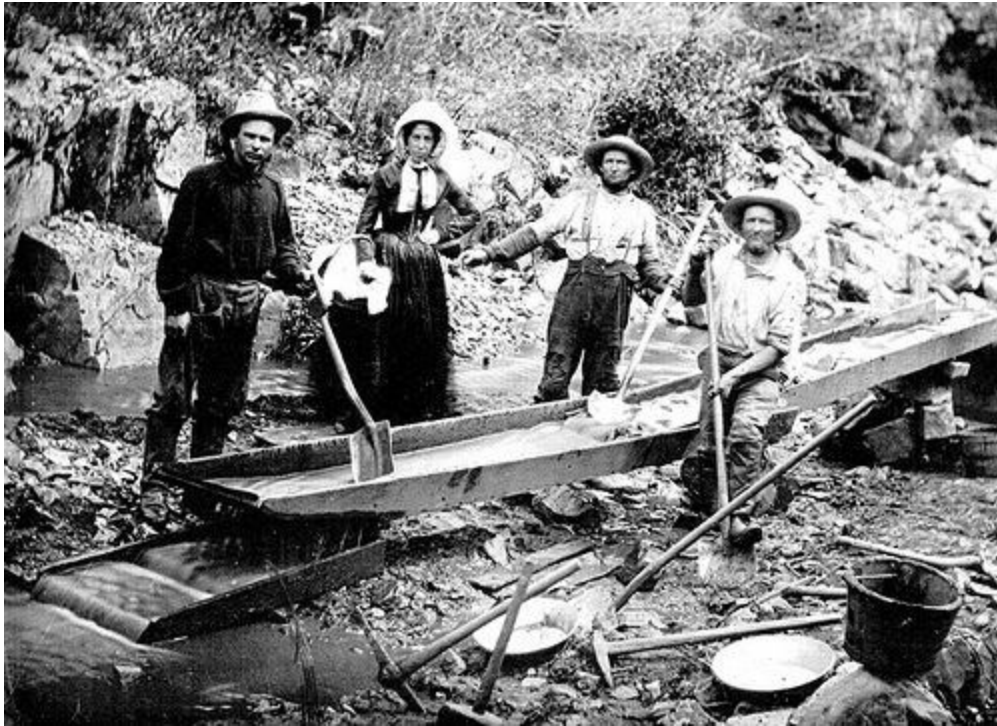
California gold miners, ca. 1850s

Just as the Treaty of Guadalupe Hidalgo was being signed, gold was found in Sutter’s Mill near Sacramento. Once word of the gold discovery got out, a tremendous surge of people from around the world flooded into California seeking a quick fortune.