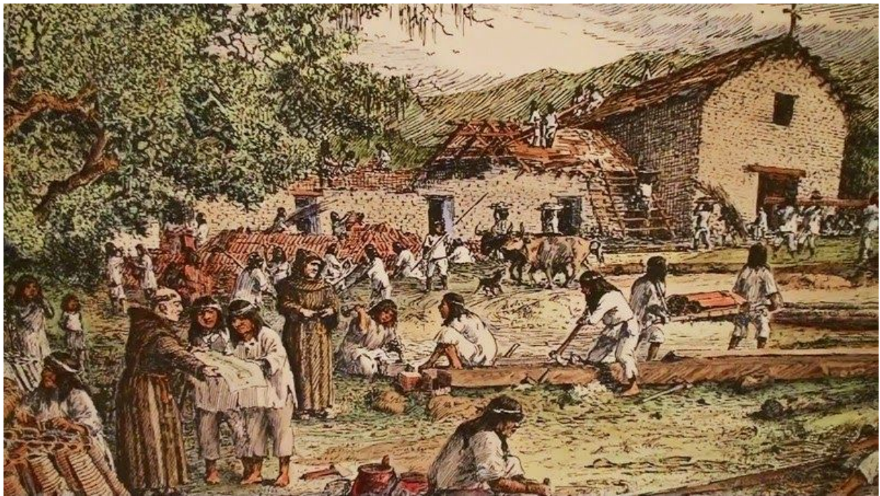
Artist's rendering of Native Californians being forced to help build a new Mission.

300,000 Native Californians. By 1834, scholars believe only about 20,000 had survived.