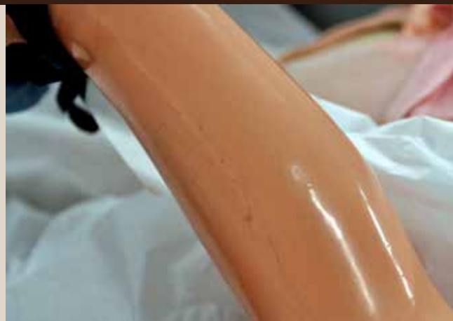
For an example of crazing, look carefully at this doll's leg for the cracks in the plastic.

Some conditions and techniques are broadly applicable. Plastics require an environment that is dark and cool, with a stable relative humidity of between 30% - 50%. Plasticizers can be drawn out by absorbent material, so when boxing or storing, it is best to use a material such as polypropylene. If plastics are wrapped in acid free tissue paper, it should be changed regularly. When plastics are exposed to light, they darken, fade or become brittle. Fluctuating temperatures