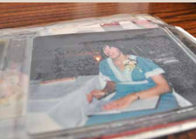
Poor storage conditions prior to donation caused the photographs in this album to fuse with the plastic album pages.