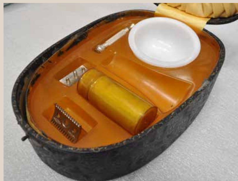
The molded plastic base of this shaving kit and the plastic canister included with the kit have yellowed over time.

Next time you are adding a plastic toy, pen or knick-knack to your box of keepsakes, remember these tips. Keep an eye out for our next edition of Adobe Trails and more information about collections work here at HAHS.